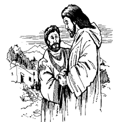
'A new Commandment, love one another...'