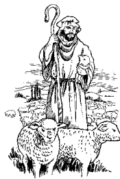
'The sheep that belong to me listen to my voice...'